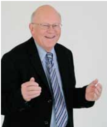
Ken Blanchard Chief Spiritual Officer of The Ken Blanchard Companies Author of “The One Minute Manager”