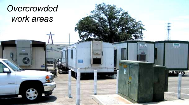
Overcrowded work areas