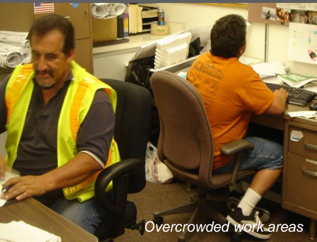
Overcrowded work areas