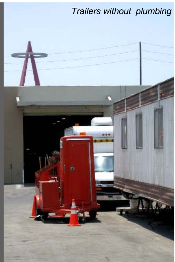
Trailers without plumbing