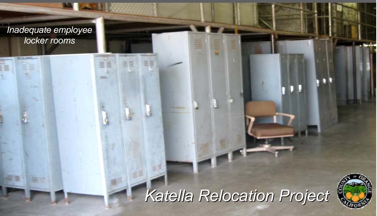
Inadequate employee locker rooms