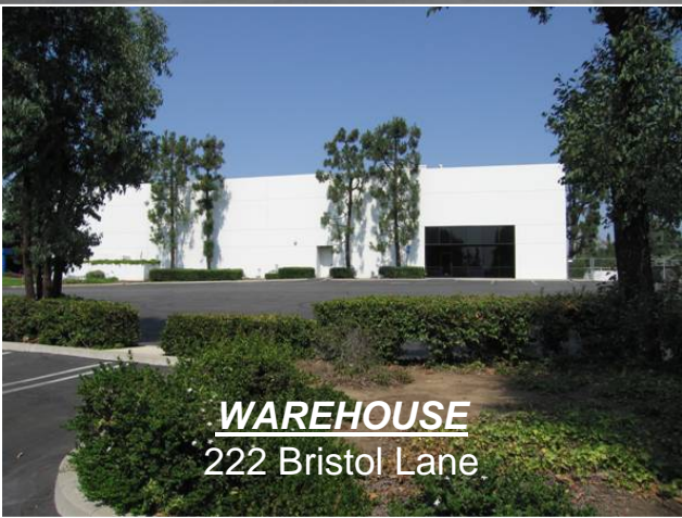
WAREHOUSE 222 Bristol Lane