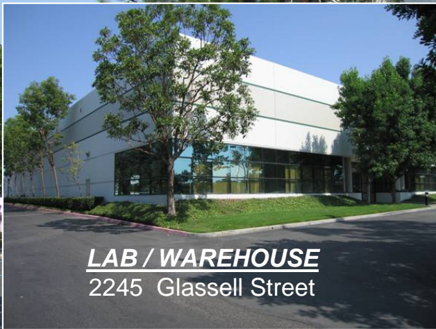
LAB / WAREHOUSE 2245 Glassell Street