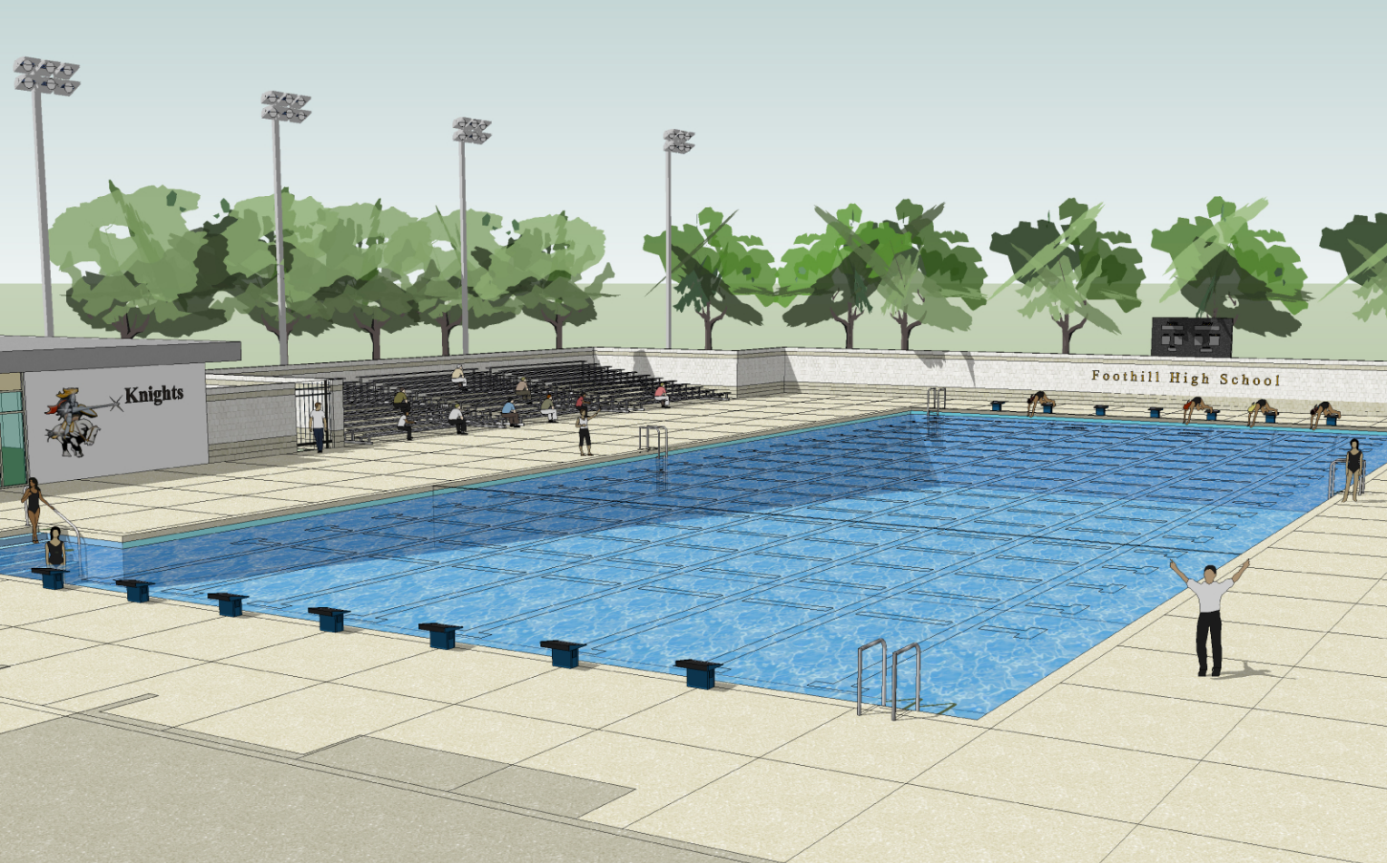
Foothill High School Aquatics Center Tustin Unified School District