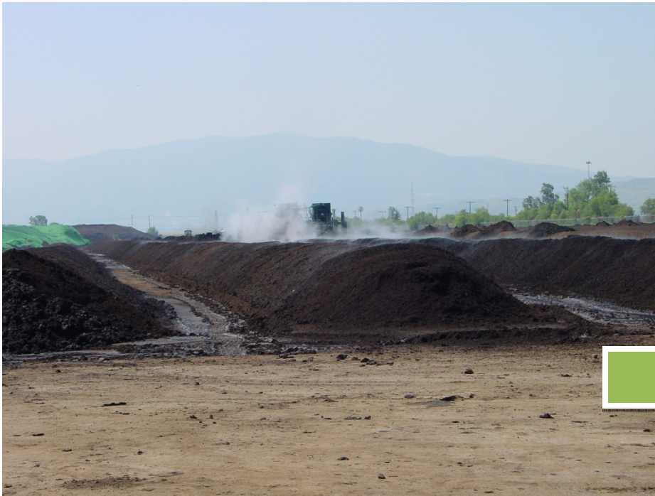
Existing IEUA Composting Facility Decommissioned in 2006