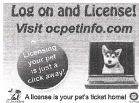
"Log on and License" television slide

OC Animal Care continues to value the importance of providing current, up-to-date resources to our community. In an effort to make licensing more convenient for our customers and to drive traffic to our website, we created a flyer with the slogan "Log on and License." The flyer is posted on our website and it will be distributed to our contract cities as a television slide to run on their local channel.