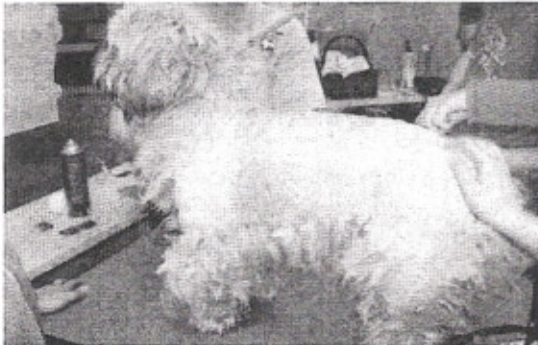
Teddy being groomed by OC Animal Care Volunteers