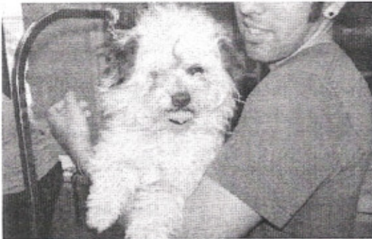
Sheba Before Grooming with an OC Animal Care Volunteer

Fifteen volunteers attended grooming training classes at Paws N Claws Day Spa in Fountain Valley. Volunteers learned the basics of using clippers, scissors and brushes on shelter dogs. All equipment and dogs are provided by OC Animal Care for the training and a professional groomer provides tips and tricks for working with shelter dogs.