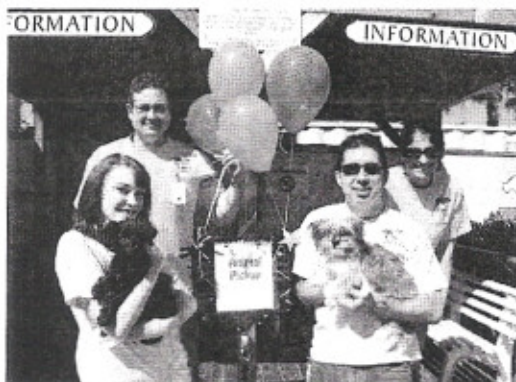
Volunteers assist at the Angels for Animals event

Angels for Animals Forever Friends for Free Event – On March 28 th , OC Animal Care hosted the Angels for Animals Forever friends for free event. During the event, available animals were adopted at a greatly reduced adoption fee. 24 volunteers assisted during the events by providing line management, staffing a customer service booth, assisting with kid's crafts, answering questions about the available animals, bathing adopted animals and releasing the adopted animals to their new owners. Volunteers were excited to see many of their favorite animals find homes and played an important role in their adoptions.