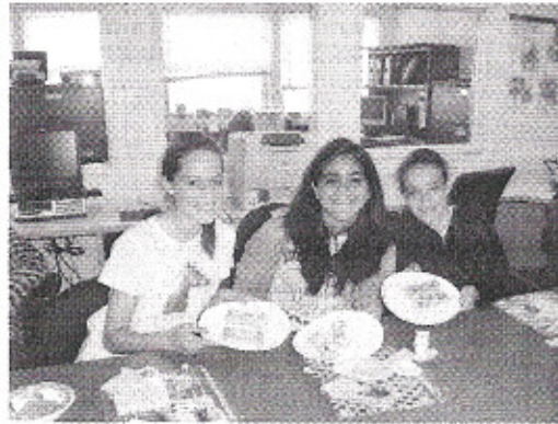
These girls show off their decorating skills at OC Animal Care's Community Service Day!

In honor of Spay Day USA, OC Animal Care hosted a special event on Saturday, February 28 th , that included a free spay or neuter to all adopters; thus reducing the adoption fee. A bake sale, information table, and a licensing booth made it a fun and successful adoption day. 56 animals found their forever homes!