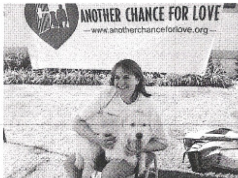
Volunteers Assist at the Spay Day event

Spay Day USA - On Saturday, February 28 th , OC Animal Care hosted its Spay Day USA event. 19 volunteers assisted with greeting and handing out shelter maps, providing customer assistance in the available dog and cat section, and bathing the newly adopted animals. Having the support of volunteers during this event was essential to the events success. Volunteers were able to assist in keeping lines moving by answering questions or directing visitors to the available animals. Several volunteers even staffed a bake sale table and raised money for Another Chance for Love's Prison Dog Program.