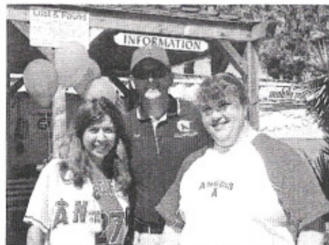
OC Animal Care's hardworking staff showing their Angels pride during "Forever Friends for Free!"

On Saturday, March 28th, OC Animal Care hosted one of its most successful adoption events ever! 127 animals were placed into forever homes during our "Angels for Animals Forever Friends for Free" event, sponsored by the Angels Baseball Foundation. Adopters were responsible for the microchip and license fees. This event was made possible by a charitable donation from the Angels Baseball Foundation. The day's festivities included: a barbeque to raise money for Explorer Post 538, a craft table for kids, an OC Animal Care veterinarian on hand to answer pet health questions, and a giveaway table with Angels Baseball bracelets and treats available for new adopters. Without the generous support of the Angels Baseball Foundation, and the hard work of OC Animal Care staff and volunteers, this event would not have been possible!