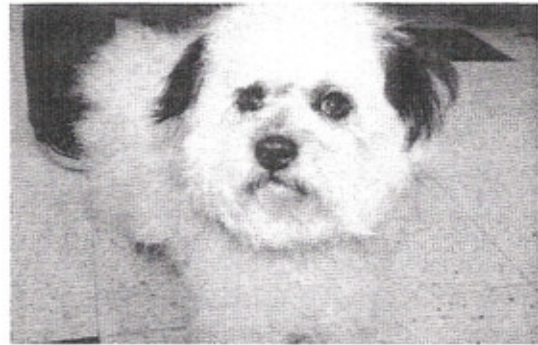
Sheba After Grooming