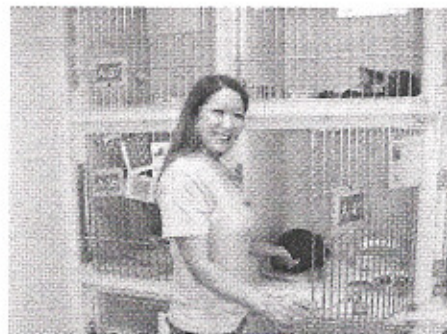
One of our amazing volunteers hard at work during our Spay Day USA event!

In honor of Spay Day USA, OC Animal Care hosted a special event on Saturday, February 28 th , that included a free spay or neuter to all adopters; thus reducing the adoption fee. A bake sale, information table, and a licensing booth made it a fun and successful adoption day. 56 animals found their forever homes!