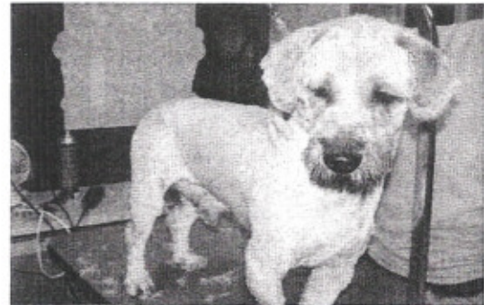
Teddy looking handsome after his grooming

Eighteen volunteers attended the Education Outreach training class held at OC Animal Care. This training was designed to teach volunteers how to lead shelter tours for school and Girl Scout troops and hosting shelter related presentations or educational booths. Seventeen volunteers have signed up to assist with the Public Education program. Six tours and one educational booth have been hosted by volunteers. By extending this opportunity to volunteers, OC Animal Care will be able to provide more educational outreach to our communities. So far, volunteers have enjoyed being a part of the educational program and have provided positive feedback to staff.