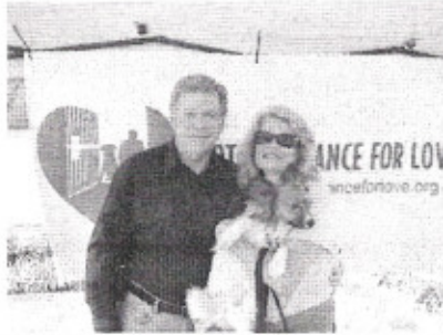
Prison Pup "Tiger" loves his forever family!

On Saturday, March 28th, OC Animal Care hosted one of its most successful adoption events ever! 127 animals were placed into forever homes during our "Angels for Animals Forever Friends for Free" event, sponsored by the Angels Baseball Foundation. Adopters were responsible for the microchip and license fees. This event was made possible by a charitable donation from the Angels Baseball Foundation. The day's festivities included: a barbeque to raise money for Explorer Post 538, a craft table for kids, an OC Animal Care veterinarian on hand to answer pet health questions, and a giveaway table with Angels Baseball bracelets and treats available for new adopters. Without the generous support of the Angels Baseball Foundation, and the hard work of OC Animal Care staff and volunteers, this event would not have been possible!