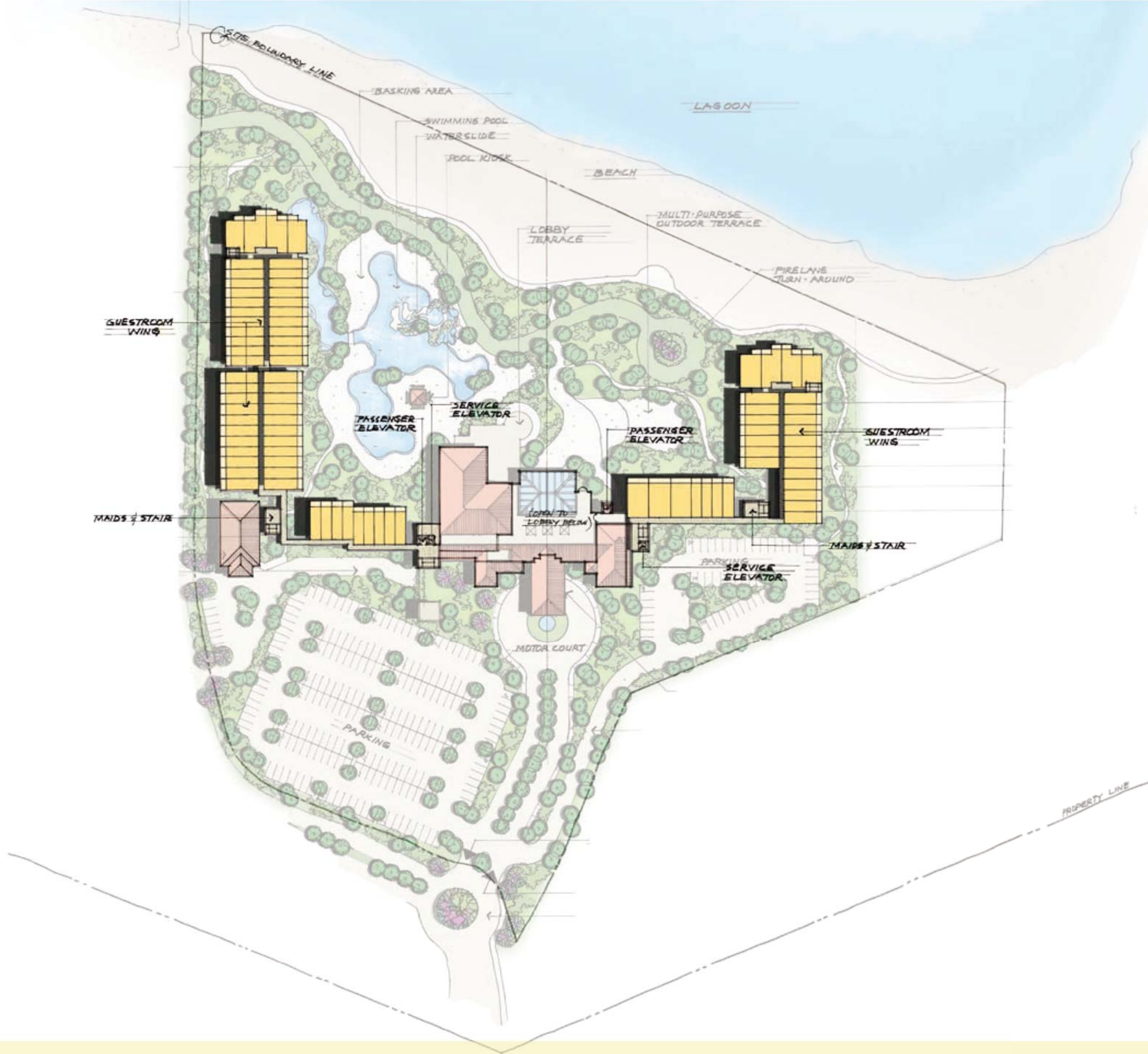
NEWPORT DUNES GUESTROOM MATRIX COMPARISON