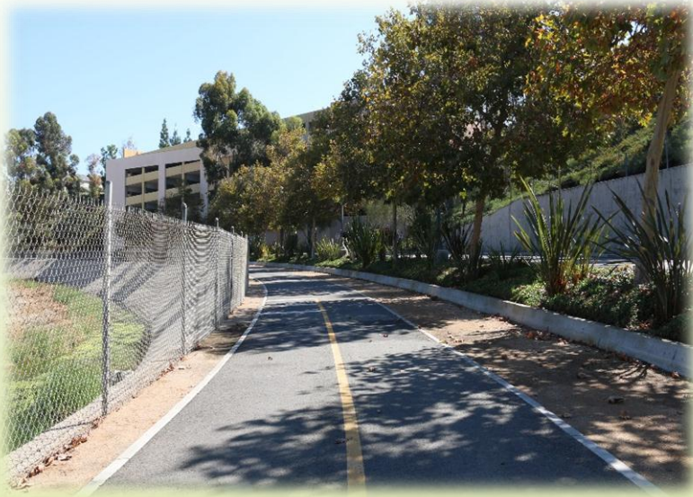
Completed Segment 1 - 2011