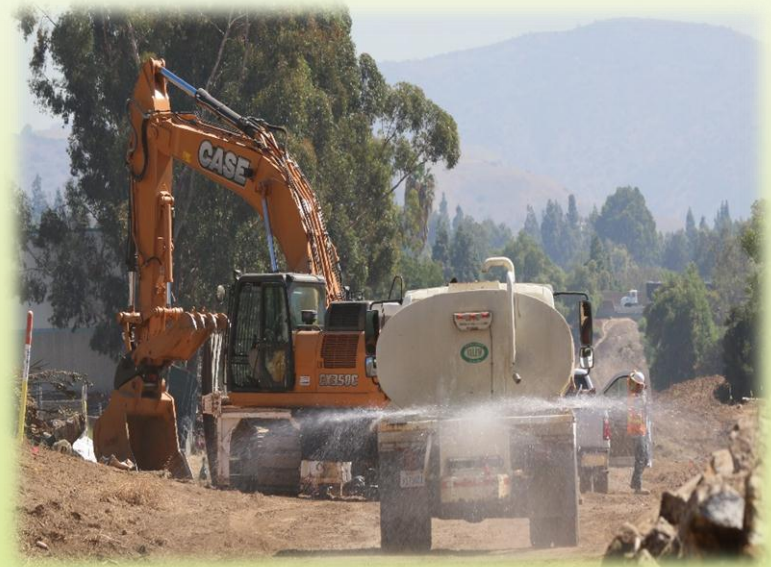
Segment 3 – Under Construction - 2014