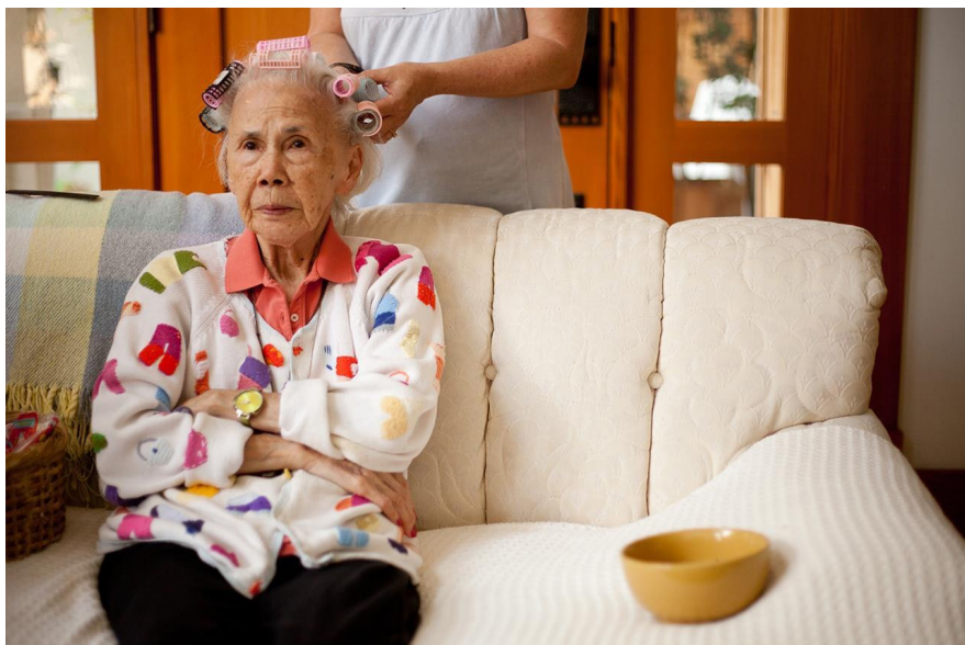
2014 1st Place - Akiko

The Council on Aging – Orange County invites professional and amateur photographers (18 and over) to share your unique interpretation of what living a long life means to you from thriving lifestyles to the harsher realities of aging.