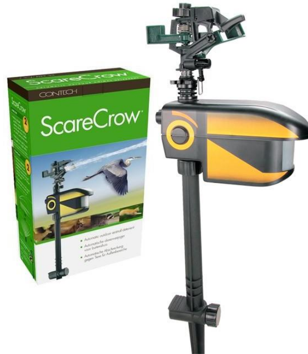
Motion Activated Sprinklers