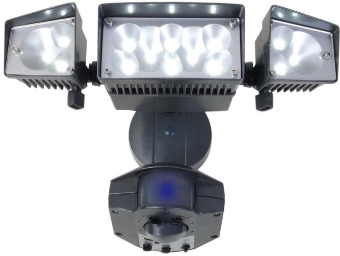
Motion Activated Outdoor Lighting