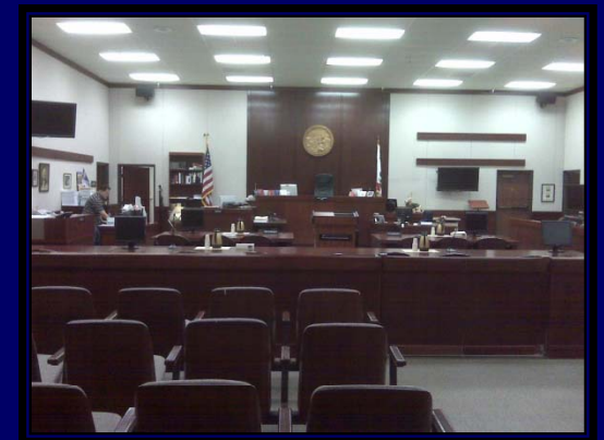
Civil Complex Center