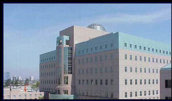
Lamoreaux Justice Center