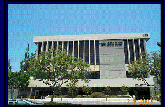
North Justice Center