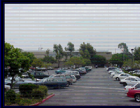
Harbor Justice Center