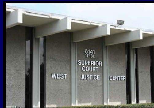
West Justice Center