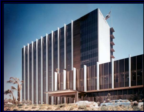
Central Justice Center