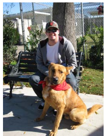
This handsome dog found his forever home during the "Forever Friends for Free" event

On Saturday, December 6th, OC Animal Care hosted it's most successful adoption event ever! 116 animals were placed into forever homes during our second annual "Forever Friends for Free" event. Adopters were responsible for microchip and license fees. Free consultations were available to adopters with a professional trainer from Another Chance for Love. An OC Animal Care veterinarian was also on hand to answer pet health questions. Children attending the event made animal masks and received coloring packets. Lots of giveaway items and baked goods for sale made the event a wonderful success!