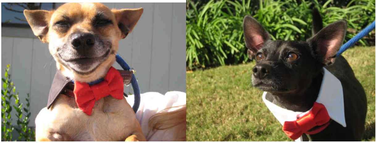
Two dogs pose for their new holiday photos

Santa Paws Photos - During the month of December, OC Animal Care volunteers and staff participated in the Santa Paws Photos at two local Petsmart stores. Not only was this a great opportunity for OC Animal Care to be in our community to provide information regarding our services, but it was a great way to raise money for the shelter. For each photo that was taken, Petsmart generously donated $5.00 back to OC Animal Care. More than 20 volunteers assisted with these events and almost 300 photos were taken. Although the photo days can be long, busy, and hot (if you are playing Santa), OC Animal Care volunteers eagerly signed up to participate. They provided customer service and line management to the people waiting for photos, they took and printed the photos, and some even dressed up as Santa. We could not have participated in this event without their dedicated service!