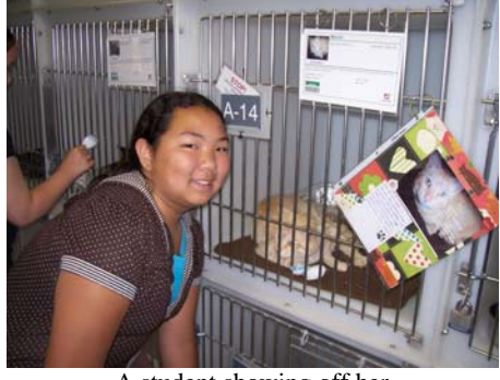
A student showing off her fancy kennel card

OC Animal Care hosted "Community Service Day" on November 15<sup>th</sup> from 10 am to 12 pm for first through sixth grade, and 1 pm to 4 pm for seventh through twelfth grade. 50 students attended the event with over 80 students on the waiting list hoping to attend. During the event, participants learned about the shelter during a behind-the-scenes tour of the facility, enjoyed games about responsible pet ownership and careers in animal care, and completed several special projects to help animals and beautify the shelter. The event was such a success that OC Animal Care hopes to offer other events like this in 2009.