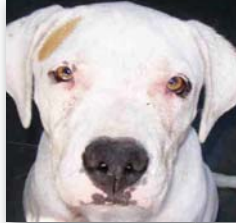
Name: Delilah ID: A0921100 Age: 7 months Breed: Pit Bull mix Delilah is a smart little pup. She knows the "sit" command and she is eager to learn more!