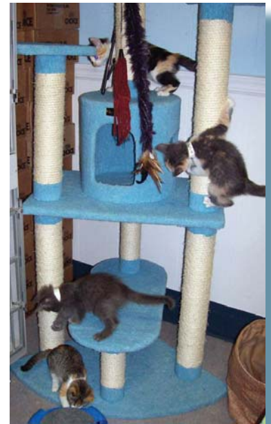
Kittens explore the toys in the new nursery

OC Animal Care is always searching for more volunteers to socialize or foster cats and kittens. If you are interested in joining the volunteer program, please visit our web site at ocpetinfo.com for volunteer opportunities. You could be the newest volunteer team member!