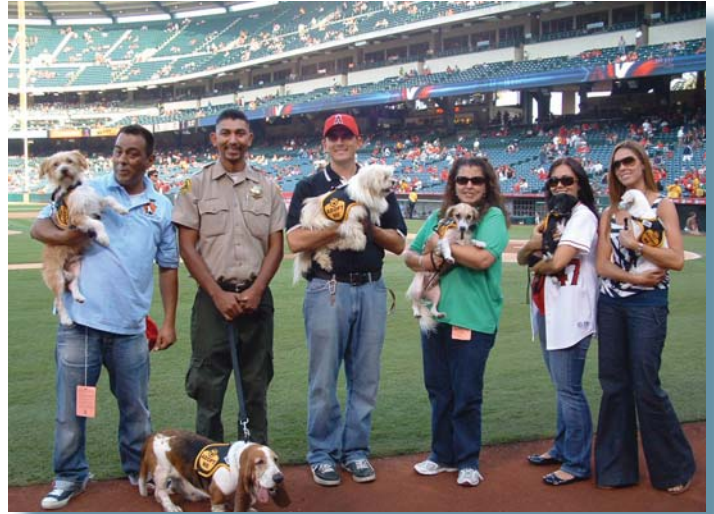
OC Animal Care staff and four-legged critters smile bright at Angels Stadium