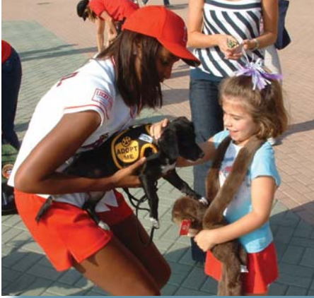
Even the littlest fans were checking out the dogs from OC Animal Care

Thanks to the compassion and kindness from the Angels Baseball Club and Foundation for making "Angels for Animals" a grand slam event!