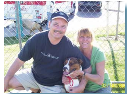
Gypsy gets adopted!