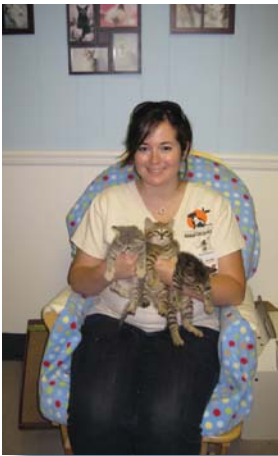
This volunteer cuddles three nursery residents

Kittens are purring for the new nursery at OC Animal Care. The nursery is a safe place for kittens to stay at the shelter until they are able to be fostered, placed with a rescue organization, or they are ready for adoption. Generous donations from the community and recent shelter construction have helped make this kitten haven possible. The nursery features spacious kennels with specialty shelving, toys for the most playful of kittens, and a socialization area for staff and volunteers to spend quality time with the smallest shelter residents.