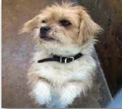
Name: Jasmin ID: A0802070 Age: 3 years Breed: Cairn Terrier mix Jasmin is a silly little girl who will dance to get your attention. She will steal your heart!