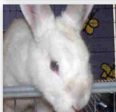
Name: Bella ID: A0919282 Age: 3 years Breed: Short hair rabbit Bella is a sweetheart who is patiently waiting for a forever home. She may want to adopt you!

OC Animal Care makes every effort to promote all of the wonderful animals we have available for adoption. At the time of publication, these animals were in need of lifelong homes. All adopted animals are spayed/neutered, vaccinated, and microchipped prior to leaving the shelter. If you are interested in adopting a pet, please visit us online at ocpetinfo.com , or simply come down to the shelter!