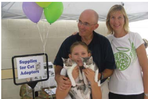
These adopters show off their newest family members!

OC Animal Care sent the Purrfect love home as 41 cats and kittens were adopted during Catopia. On August 23 rd , OC Animal Care hosted our first-ever event to promote shelter cats. New adopters received a free spay or neuter for their new feline friend, a free carrier, and pet care supplies. Children attending the event made catnip toys for the cats in the shelter and enjoyed kitten coloring sheets. Best Friends Animal Network, an organization promoting humane treatment of animals, provided information on adoptable animals and opportunities to get involved in their organization. Cat lovers also had the opportunity to view the new kitten nursery at the shelter for kittens too young to be adopted. OC Animal Care staff and volunteers celebrated as the dreams of 41 cats and kittens came true in finding the forever homes they had been dreaming about!