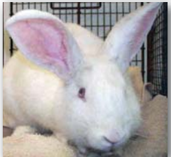
Name: Larry ID: A0915005 Age: 1 year Breed: New Zealand Larry is a playful bunny who is always ready to play. Come see him hop about!