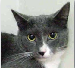
Name: Blue ID: A0921279 Age: 2 years Breed: Domestic short hair Blue is a talker. Come visit him and he will be sure to greet you!