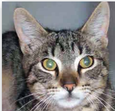
Name: Max ID: A0922729 Age: 6 months Breed: Domestic short hair Max loves to nap on a cozy blanket. Make him your cuddle buddy!