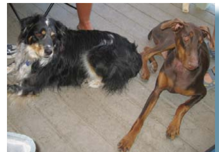
"The Lads" lounging on the deck