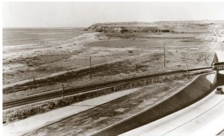
Doheny before it was Doheny, mid 1920's