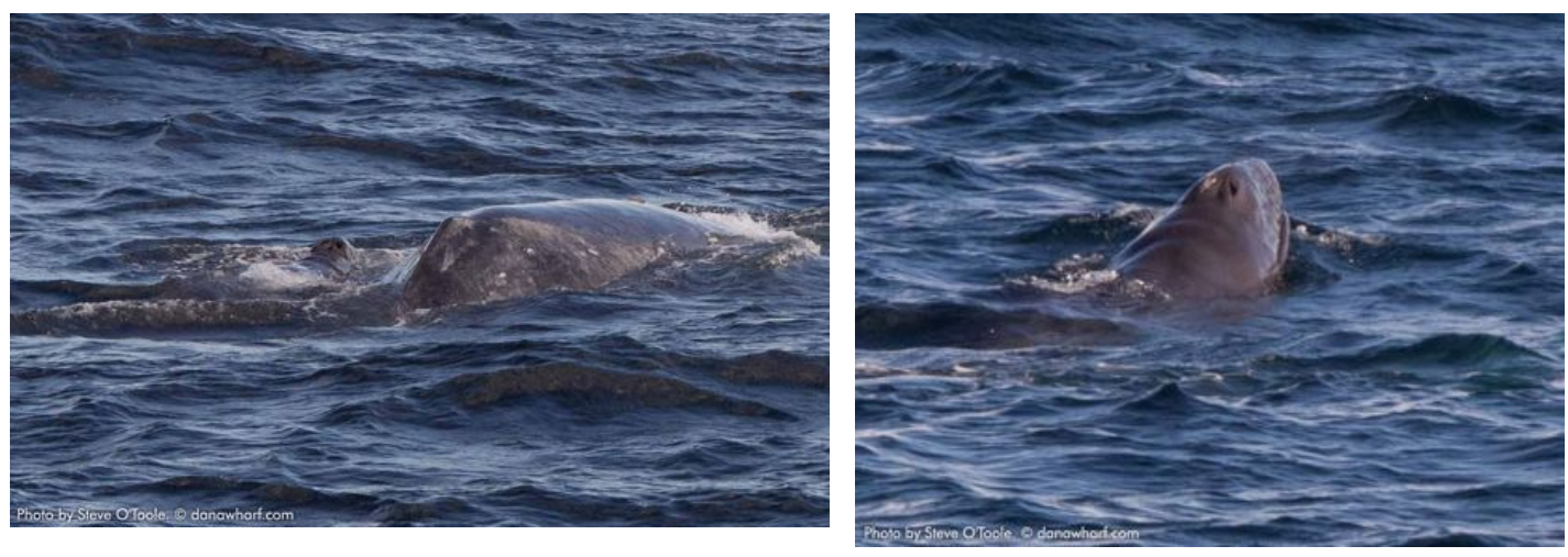
Momma Gray and her calf

AND SPEAKING OF WHALES: Dana Wharf Sports Fishing and Whale Watching sends us the link to a video of Finnegan the fin whale that's been hanging out off of Doheny and photos of the first grays they've spotted this year, a mom and new baby. <u>http://www.youtube.com/watch?v=-7R7NVJjKSY&feature=endscreen&NR=1</u>