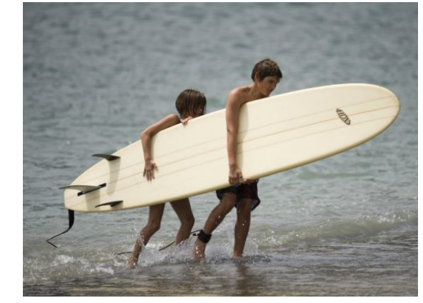
Doho visitors from Arizona

LOOKING FOR A TAX DEDUCTION? We're entering the last quarter of the year and some individuals, families and businesses are thinking about their 2012 taxes. If you could use another deduction, why not consider us, Doheny State Beach Interpretive Association.