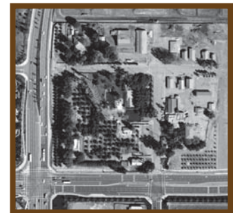
Irvine Ranch Historic Park

The Orange County Farm Bureau hosts a community Farmers Market in cooperation with the County of Orange. The Farmers Market is open every Tuesday from 9 a.m. to 1 p.m. and primarily features fresh produce.