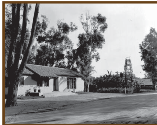
Former Irvine Ranch Agricultural Headquarters

The Katie Wheeler Branch Library has recreated the exterior of the Irvine family home on its original site and adapted the structure to provide library services.