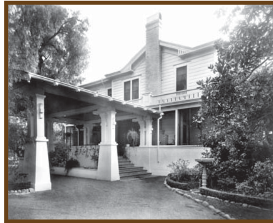
Original Irvine Family Ranch House

O range County Parks adopted a Master Planning Program that established the prime historic period from 1876 to 1947 as a guide for future restoration and interpretation of the historic property.