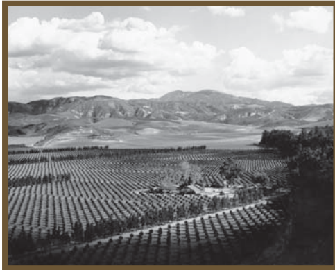
The Irvine Ranch

I rvine Ranch Historic Park is a 16.5 acre special use park established by the County in 1996. The park retains 24 original ranch structures that represent the proud agricultural history of Orange County and, specifically, the Irvine Ranch. It was once one of the world's greatest producers of Valencia oranges, and a leader in dry farming and livestock.